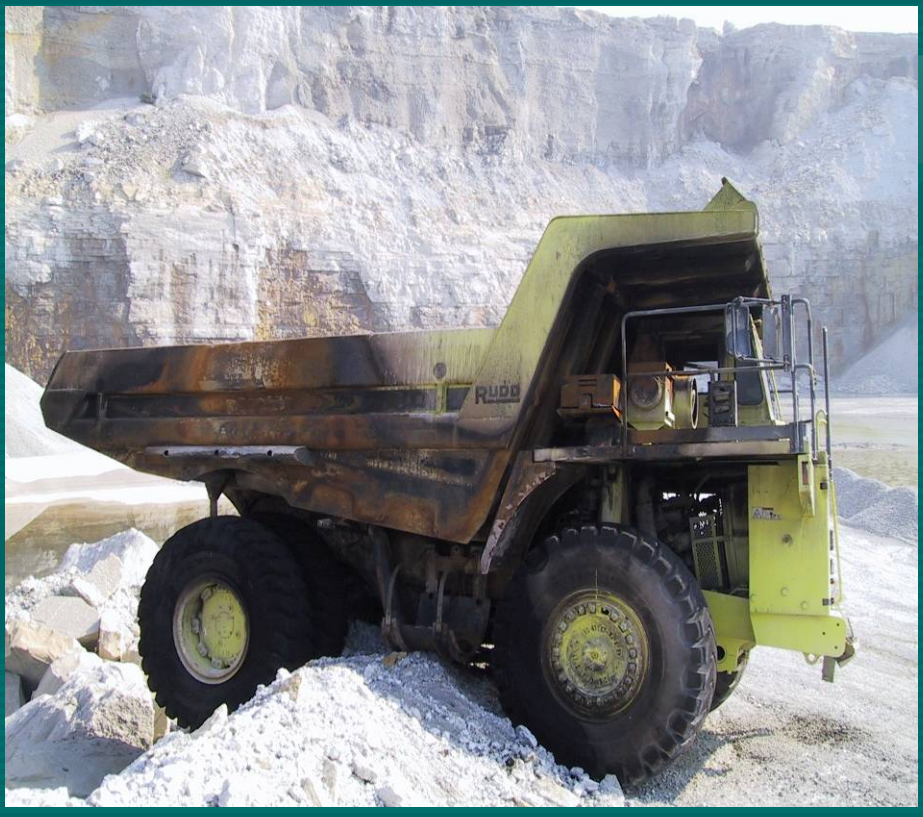
Fire Suppression Systems in Mines